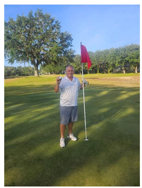
Edelman #18 4/25/25