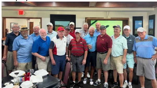
Men Players in no particular order: