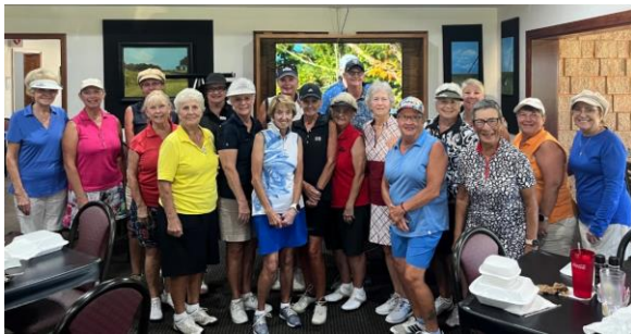
Lady Players in no particular order:

The 2022 Battle of the Sexes tournament was a spectacular display of competition golf and the teams played hard until the end. What a day for golf and friendly competition. This one went down to the wire and the women team came on top with 5 ½ points taking the men team down and claiming bragging rights for the next 12 months. CONGRATULATIONS TO!!!!!!!