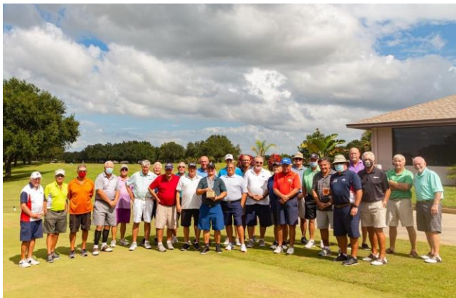
The winners – the Guys