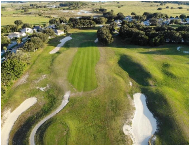
A cool picture of #10 after the first cut.