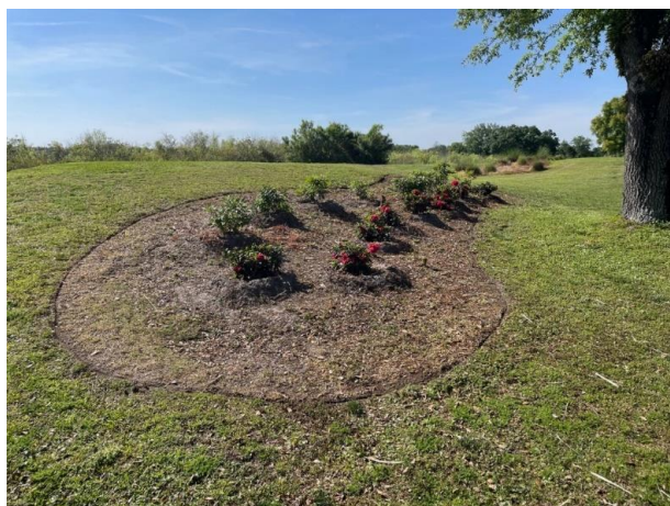
Hole #4 Wendell & Kimbra McDannel