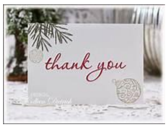
Dear Members & Residents,

An invitation to each MWGA member is sent out each week. Look for yours on email, and plan to join us for some great competition. The MWGA charges $3 for each weekly Thursday game (charged to your account). For special events, the cost is $8. Note: After Thursday golf, MWGA members often retire to the Crown and Shield for lunch. Make a plan to join other members for some fun and camaraderie!