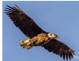
EAGLES ARE FLYING