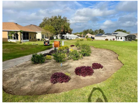
#16 After (amazing)