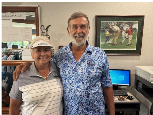
1st place NET – 2024 Couple's Club Champions

Your 2024 Couple's Club Champions top three NET teams are: