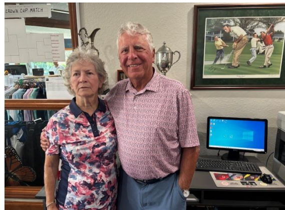
2nd place GROSS