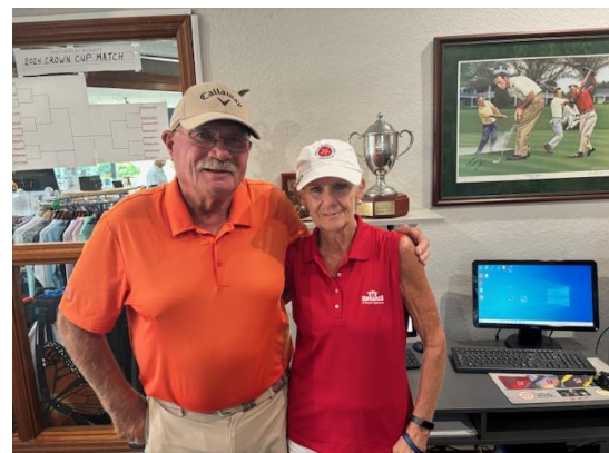
1st place GROSS – 2024 Couple's Club Champions

Your 2024 Couple's Club Champions top three GROSS teams are: