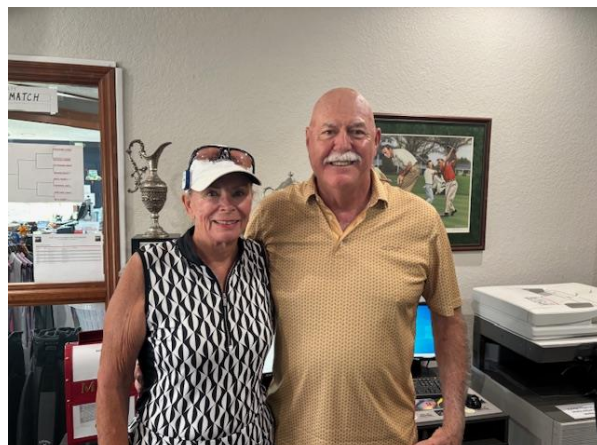
3rd place NET