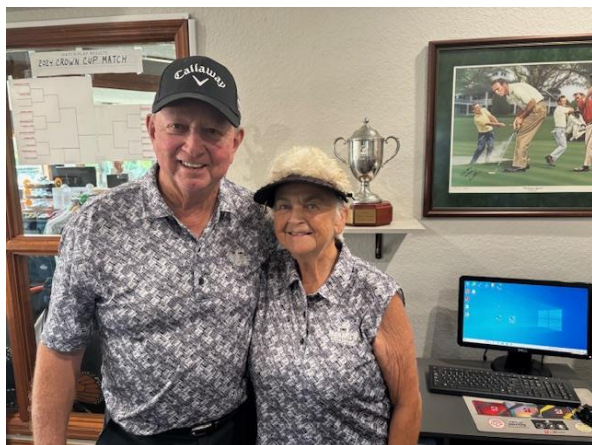
3rd place GROSS