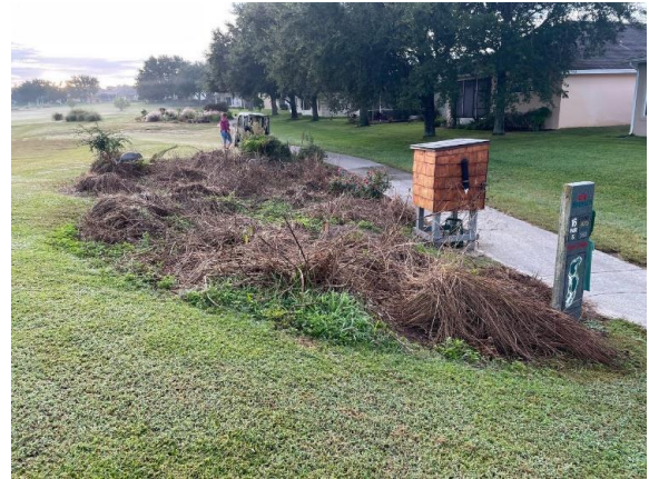
#16 Before (another view)