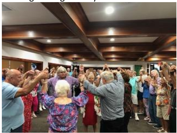
God Bless the USA