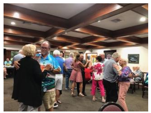
Dancing the Night Away