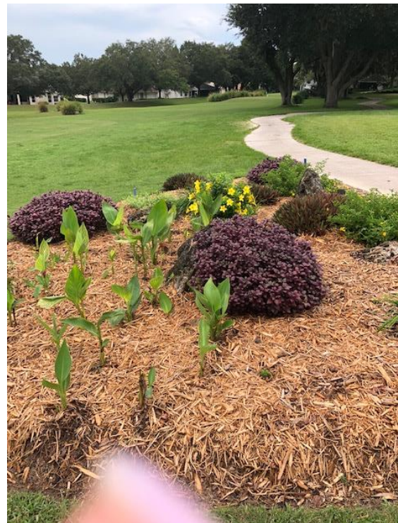
Robin Teets, #13 Green