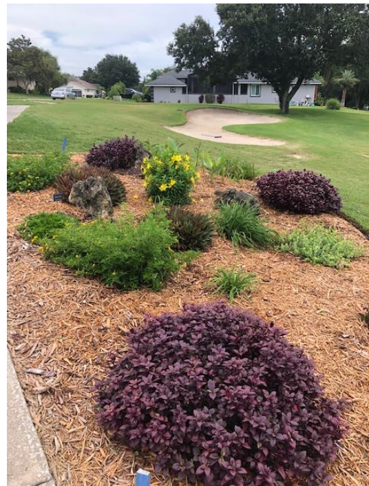
Robin Teets #13 Green