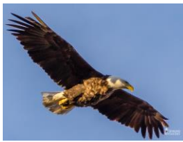
EAGLES ARE FLYING